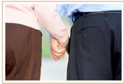
Average Annual Long-Term Care Insurance Premium*

NAELA encourages all individuals over the age of 50 to consider long-term care insurance. It is important for individuals to apply for the insurance while they are still in good health. Sadly, many wait too long to apply. According to a 2005 report from the American Association for Long-Term Care Insurance, more than half (57.2 percent) of long-term care insurance applicants over age 80 are denied coverage. Overall, one in five (19.2 percent) Americans who applied for long-term care insurance was declined.